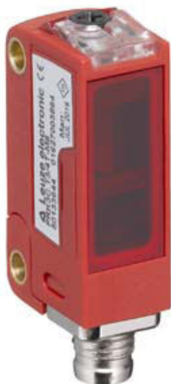
Figure can vary