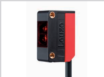
Cable outlets - Integration even in extremely limited installation spaces thanks to flexible cable outlet at the bottom or rear of the device

Flexibly adjustable side mounting for bracket or rod.