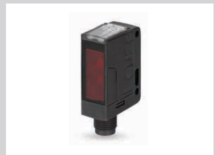
Through holes for M3 screws