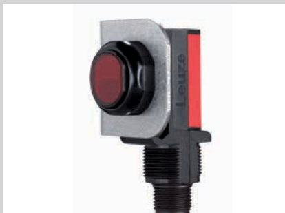
On the front with M18 hole mounting at the beam exit