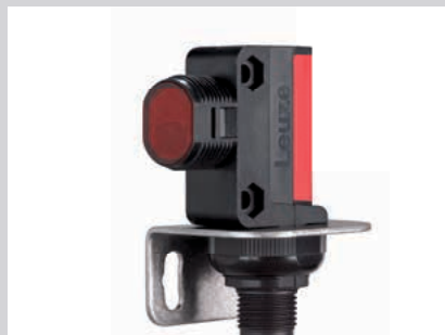
Standing screw fitting or M18 thread on the bottom of the device