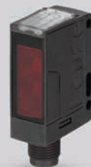
Retro-reflective photoelectric sensors