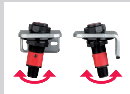
Fine adjustment of \pm 8^\circ possible with omni-mount

Simple and reproducible M18 hole mounting by means of the two mounting nuts, which are positioned flatly one on top of the other.