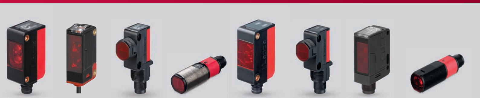
Diffuse reflection sensor - energetic