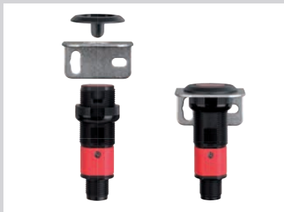
Embedded installation with clip