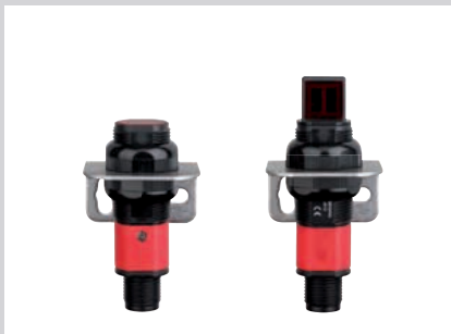
Attachment using mounting bracket with axial or angled optical outlet

For limited installation space in M18 hole with minimum mechanical set-up, also with angled head.