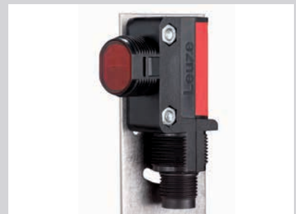
On the side using robust screw fitting on the housing