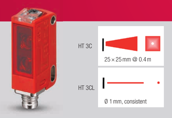
Diffuse reflection sensor with background suppression HT 3C/HT 3CL