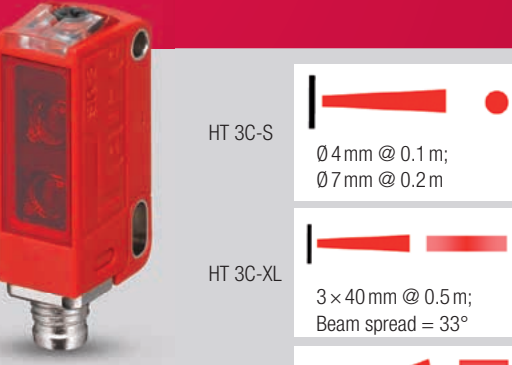
Sensor for demanding HT 3C-V object detection HT 3C-S/-XL/-V